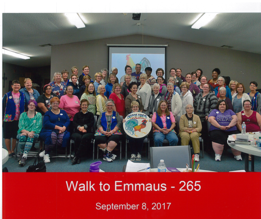
Walk to Emmaus - 265 September 8, 2017