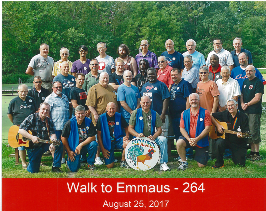
Walk to Emmaus - 264 August 25, 2017